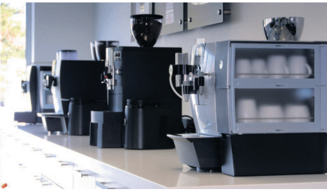
Bates Enterprises | SUBMITTED Jura espresso makers are seen in 2014. Bates Enterprises, an affiliate of the Swiss maker of the high-end espresso machines, plans to double its workforce and size when it builds a $17 million hospitality center near Mount Joy. Jura's machines. At their Oct. 20 meeting, the Rapho Township supervisors approved rezoning

Continued from A1 Jura was not awarded a grant in the first round, which was announced last week. The state indicated a second round could be awarded but did not give a timeline. Jura wants to move across the township closer to Mount Joy to build its own facility rather than lease it at the industrial park. The 1,600-square-foot retail center, south of Route 772 and just west of Route 283, sells reconditioned and new espresso and cappuccino makers and accessories from Jura. Bates also has a 25,000-square-foot service plant, which reconditions